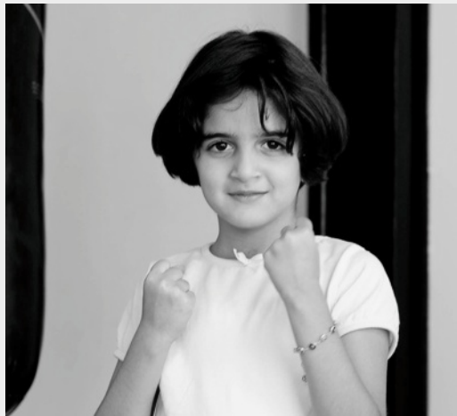
Zen-Do can help children improve their confidence and self-esteem.

At Zen-Do we teach your child in a, safe, secure and fun environment. We teach basic kickboxing skills in a nurturing environment using positive reinforcement, where we focus on character development - not on the school's glory. In addition, we teach using an education-based curriculum. All this helps boost your child's self-image, self-esteem and confidence.