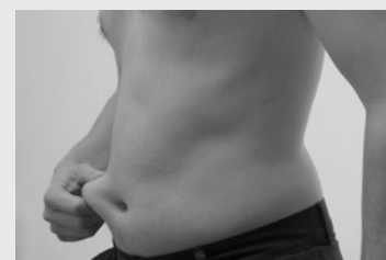
The DreamBody Centre can help you lose weight and inches of fat.

To tell you the truth I was very hesitant when I heard about The Dream Body Centre 23 minutes weight loss concept. The idea of transforming your body in just 23 minutes was something new to me at that time, as I am used to the idea of spending at least 2 to 3 hours in a traditional gym if not more.