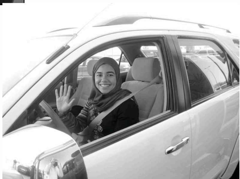
RIGHT: Driving off in her (my!) car.