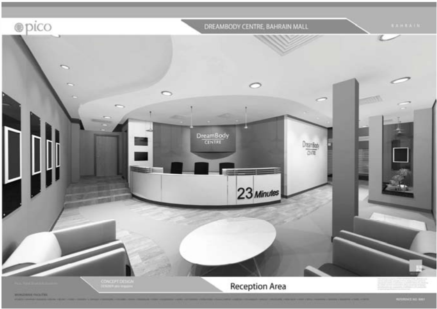
ABOVE: The new reception area