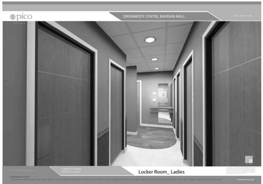
RIGHT and BELOW: different views of the changing rooms.