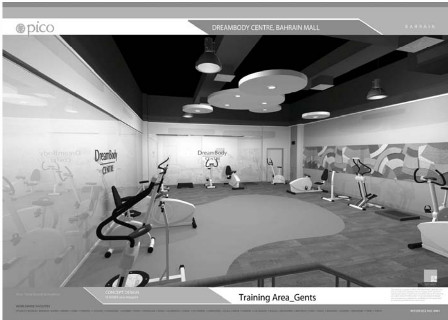
ABOVE and RIGHT : The training areas.